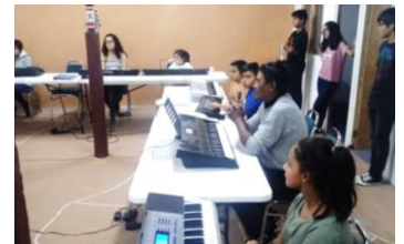
Instrumental classes offered By our church musicians