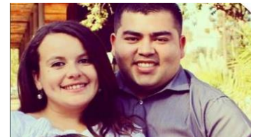
New Missionary to Ecuador We have started to support