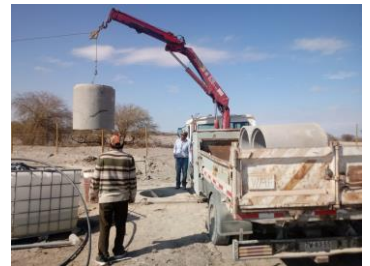
Process of making the well.

Thank You for your love, prayers and support!