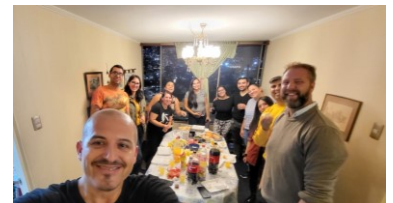
(New Small Group)