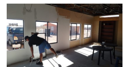
(advancement in the house/church La Huayca)