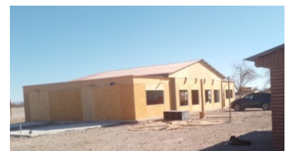
(advancement in the house/church La Huayca)