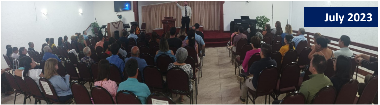
(Church service in Iglesia Biblica Bautista Iquique)