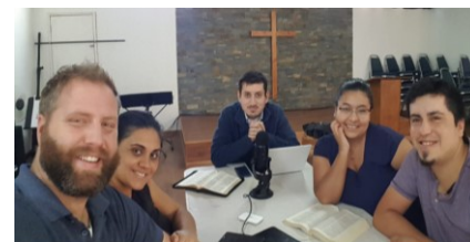
Recording message and teachings

That my stolen vehicle be found in good shape.