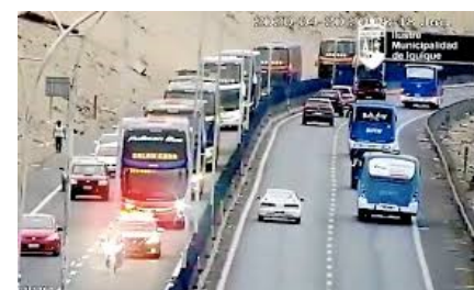
500 Bolivians sent on 15 buses to finish their quarantine in Iquique