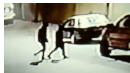
Camera recording of the two men who stole my truck