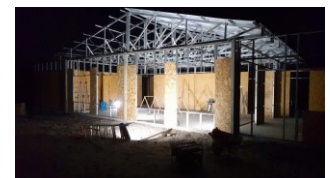
(Construction House-Church Camp)