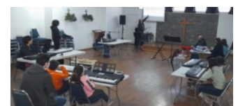
(Instrument Class Outreach)