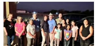
(First meeting in La Huayca)