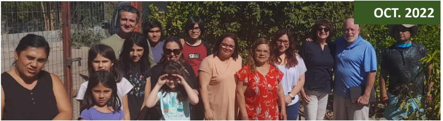
(First Bible Study meeting in Pica)