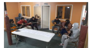
(Instrument Class Outreach)