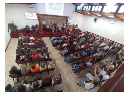
(Anniversary service in Iglesia Biblica Bautista Iquique)