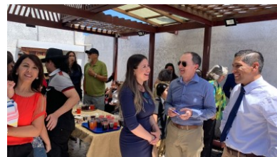
(After service pictures Anniversary)