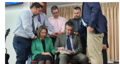
(Commissioning of Guillermo)