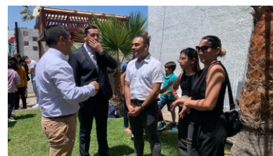
(After service pictures Anniversary)