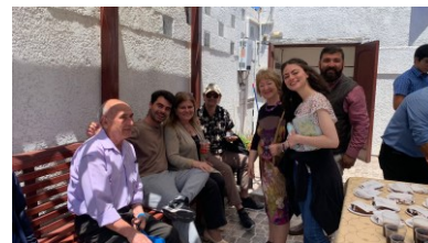
(After service pictures Anniversary)