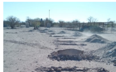
(80 holes for trees)