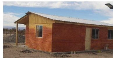
(Cabin getting painted)